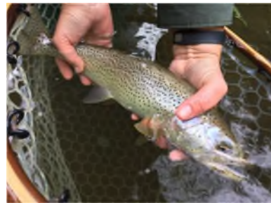
Figure 1. Coastal cutthroat trout

Trout season has arrived and it is our responsibility to promote ethical stewardship of the lakes and streams we fish to ensure healthy streams with clean flows, intact habitats, thriving insect life, and robust trout populations exist for future generations to enjoy. It is good practice to be aware of water conditions when fishing in areas with high summertime temperatures. A small thermometer is easy to carry in your fly fishing vest or pack to monitor water temperatures throughout the day while fishing. Trout face extreme stress in water above 67°F. Consider fishing the mornings only and not fishing after 12:00 pm. This is the "hoot owl" restriction, where anglers voluntarily stop fishing during the hottest parts of the day.