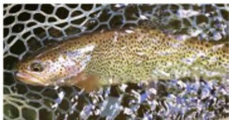
Figure 2. Coastal cutthroat trout

Always remember to pinch your barbs, use rubber or knotless landing nets instead of nylon so not to damage trout's protective slime layer, and always wet your hands before handling fish.