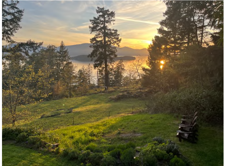
Salt Spring Island, Gulf Islands, Canada