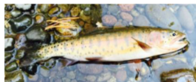
Figure 3. Lahontan cutthroat trout

The simplest stewardship practice is to always pack out trash. Those clipped tippet tags, monofilament scraps, and other small debris are easy to overlook but harmful to fish and wildlife. Bringing a small trash bag or a zip lock bag to pick up trash while fishing will help keep our lakes and streams pristine. Have fun on the water, practice fishing conservation ethics, and keep'em wet.