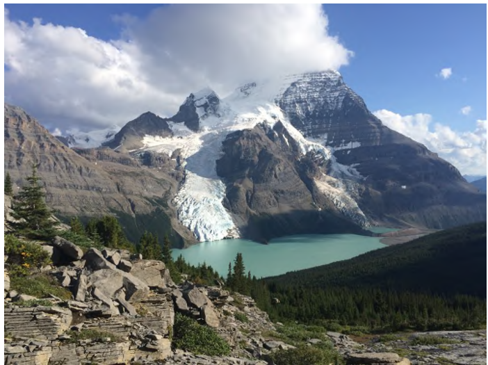
Berg Lake in the Shadow of Mount Robson, British Columbia Province, Canada